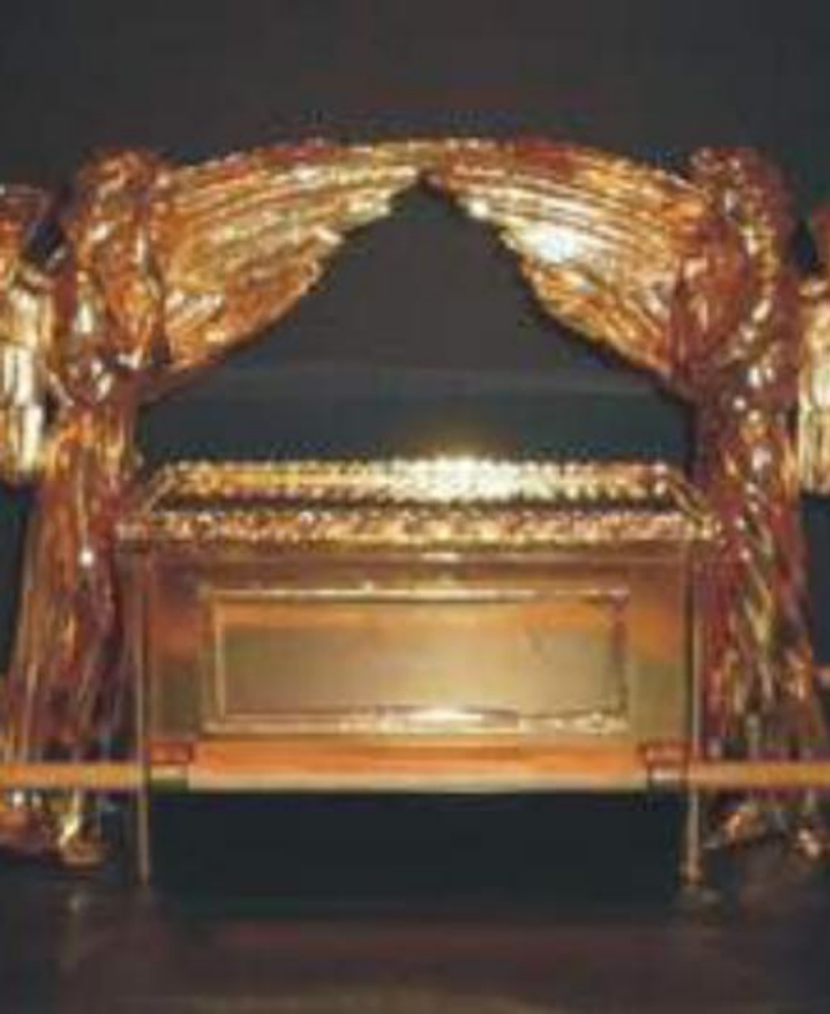
Ark of the Covenant 约柜