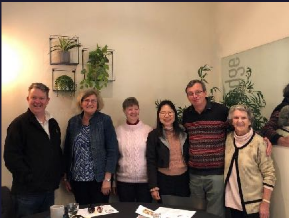
克立浸信教会 COLLIE BAPTIST CHURCH