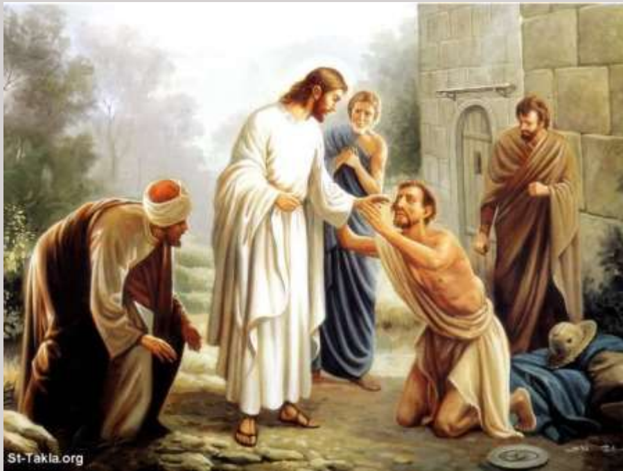
瞎子 Blind man