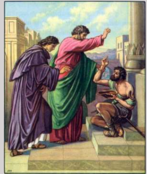
瘸腿 Lame man